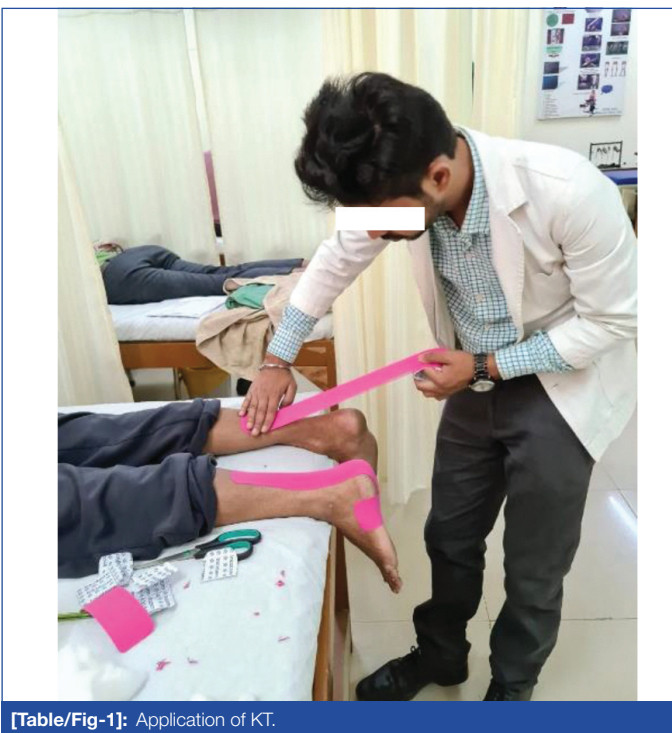
Group B (nerve flossing technique along with conventional physiotherapy): Subjects were given conventional physiotherapy which includes [18]:

Then kinesiology taping was applied over the lateral and medial malleoli and posterior part of leg up to 15 cm for two days on alternative days [Table/Fig-1,2]. The treatment was given three days alternatively in a week for two weeks.