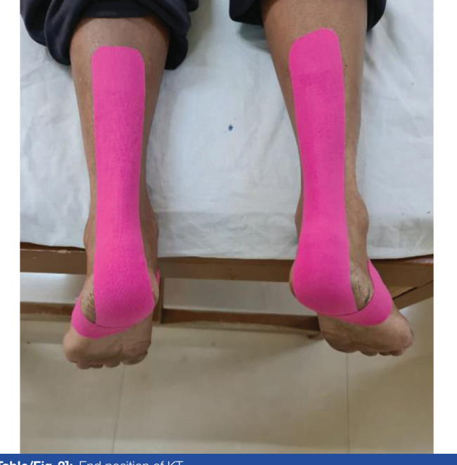
[Table/Fig-2]: End position of KT.

Then nerve flossing for the tibial nerve was administered maintaining the glide for five seconds, then repeating 15 times for three sets