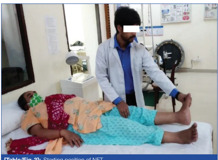
[Table/Fig-3]: Starting position of NFT

[Table/Fig-3,4] [16]. The treatment was given three days alternatively in a week for two weeks.